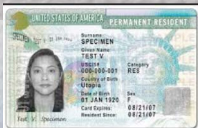
Permanent Resident Green Card