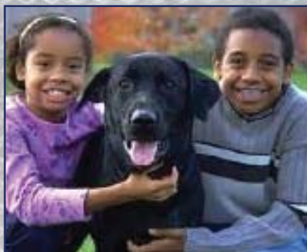
Family photo with pets