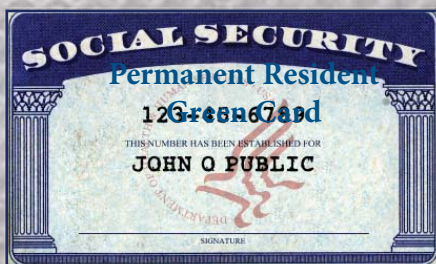
Social Security Card