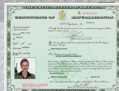
Certificate of Naturalization Card

Keeping New England Prepared FEMA Region 1 National Preparedness Division www.fema.gov/region-i-national-preparedness-0 Phone: 877-336-2734