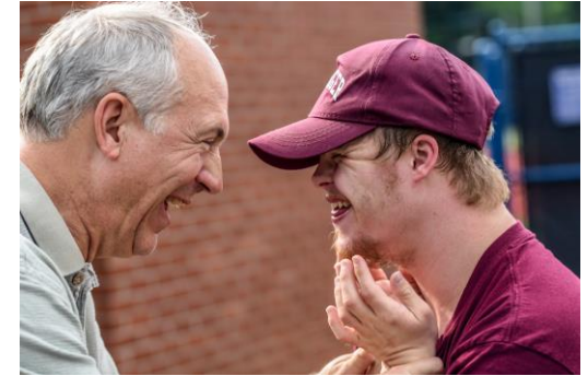
These benefits are available for Medicare beneficiaries of all ages.

All assistance is completely free and unbiased. Call today!