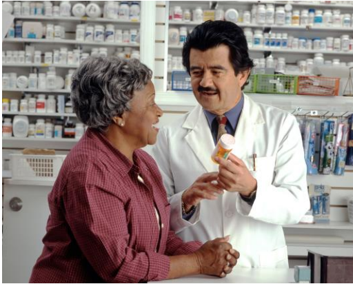
The Medicare Extra Help program can save you money at the pharmacy.